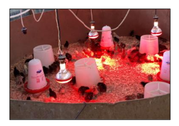
An artificial brooder using infrared bulbs for heating

In brooding, provide the right temperature for the chicks, feed and water as seen in the illustration of artificial brooding below.