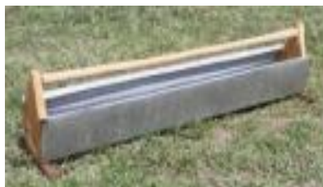
Naivasha long (1m) feeder for about 20 mature birds