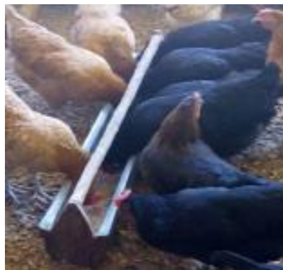
Supplementary chicken feeding from the Naivasha long feeder

Production capability of a bird is reduced by lack of enough feed and water. Egg production and growth of indigenous chicken maybe improved through supplementary feeding.