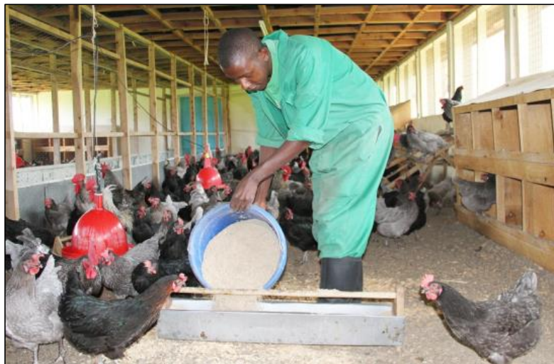
Confined chicken fed on commercial feeds