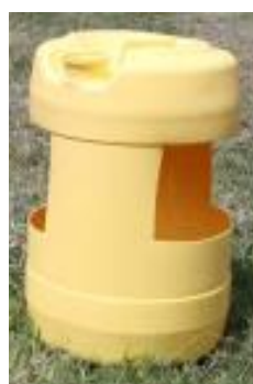
Chicken waterer for about 20 mature birds